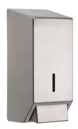
Plasma Range A tough elegant washroom range providing reliability in use and ease of servicing.