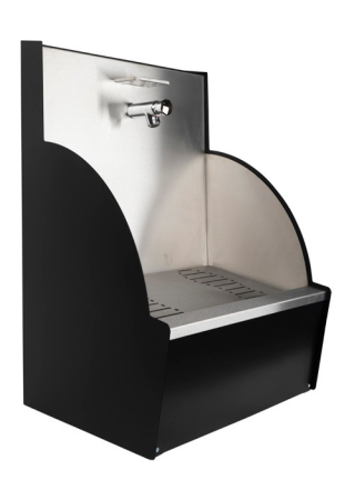
Specialist Washstations Hygiene solutions for all spaces.