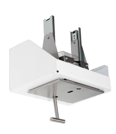
Classic Behind the Mirror Utilise the concealed space behind a mirror.