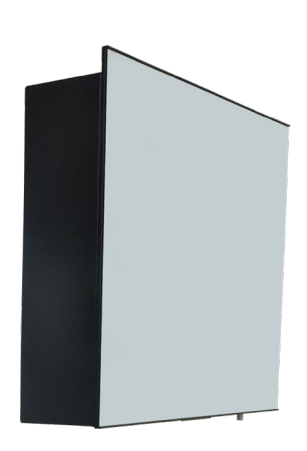
Modulo Behind the Mirror Space saving hand hygiene tailored to your washroom.