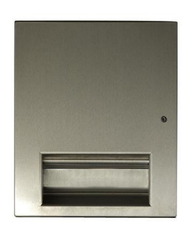
Recessed Units Maximise the space available in washrooms by recessing essential units.